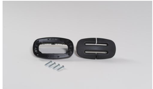
TBB2468360H Bezel (Inner/Outer)