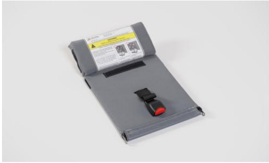
TBB2472508H ICS Module (Specify vinyl & color)