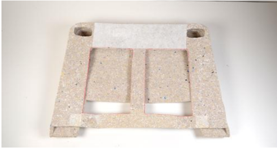
45" ICS Lap/Shlder Foam: TBB2470332 39" ICS Lap/Shlder Foam: TBB2470330 36" ICS Lap/Shlder Foam: TBB2470326