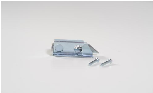
TBB2470194H Cushion Latch w/Hardware