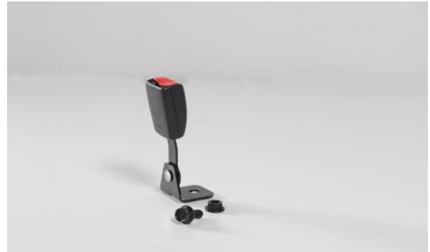
TBB2466758H Sgl Buckle Blk