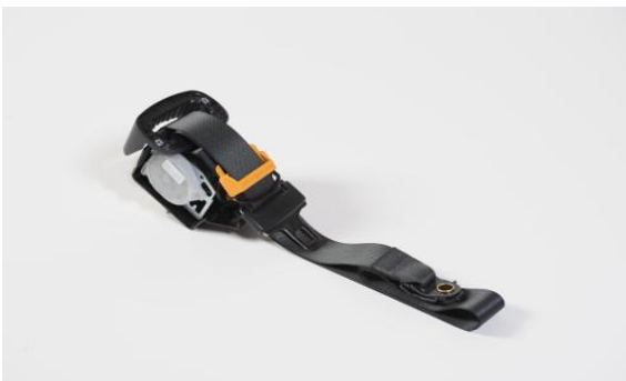
TBB2468210 Lap/Shlder Assy Blk