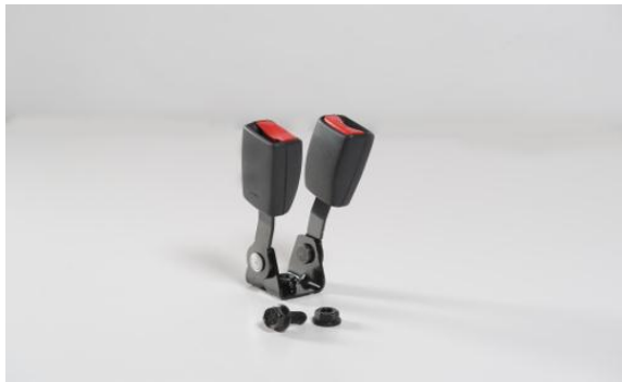
TBB2466757H Dbl Buckle Blk