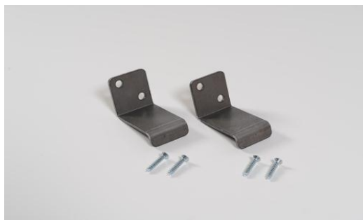
TBB2468373H Frt Mtg Brackets w/Hardware