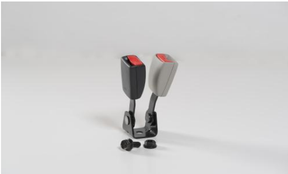
TBB2466759H Dbl Buckle Blk/Gray