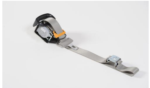
TBB2468211 Lap/Shlder Assy Gray