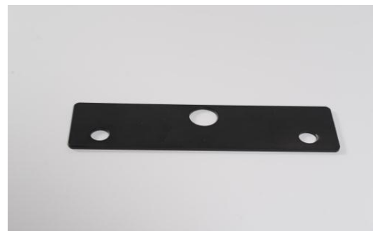
TBB2468367 Mounting Plate