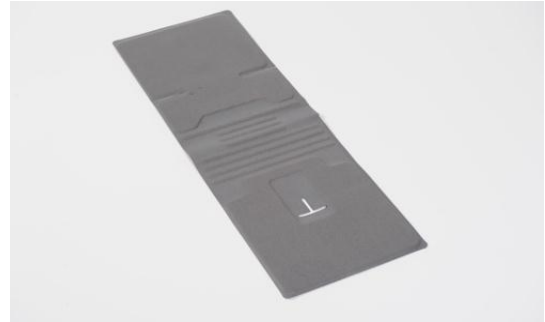
TBB2468992 ICS Seat Liner