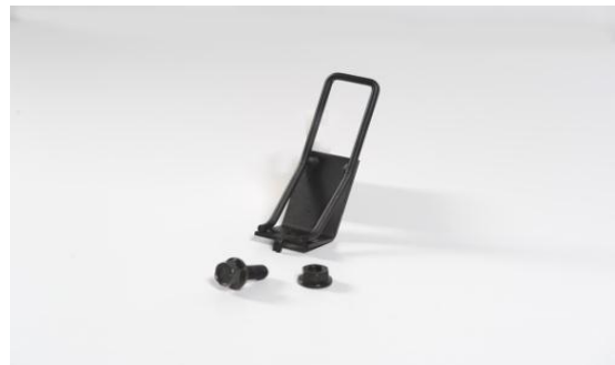
TBB2470266H ISO Latch w/Hardware