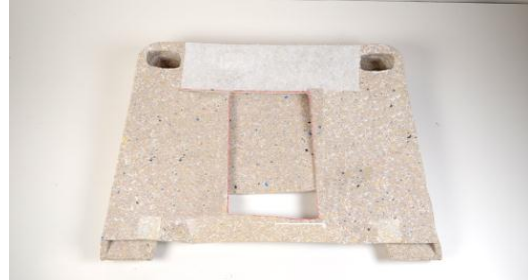
30" ICS Lap/Shlder Foam: TBB2470323