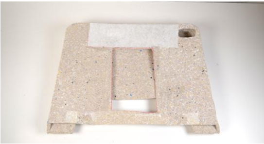
26" ICS Lap/Shlder Foam: TBB2470322