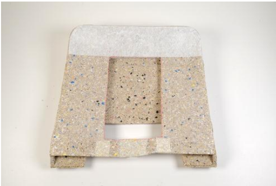
30" ICS No Belts Foam: TBB2470324 26" ICS No Belts Foam: TBB2470328